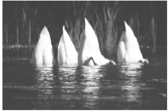
Four geese at Ludington State Park doing stunning impressions of Cleopatra's Needle.

CLC North Bay , 18.5'x20", 8" Beckson pry out hatches, ep-